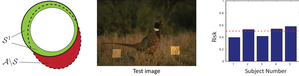
Figure 1: An illustration of our two-way, forced choice experiment. The left figure shows the Venn diagram of boundary subsets. The thick circle encompasses the full boundary set \mathcal{S} . Within \mathcal{S} , the set of orphan labels \mathcal{S}^1 is shown in green. The pB boundary set \mathcal{A} is the dotted ellipsoid. The set of edges falsely identified by the algorithm, \mathcal{A} \setminus \mathcal{S} , is highlighted in red. In each trial, we randomly select one boundary segment from \mathcal{S}^1 (green ring) and another from \mathcal{A} \setminus \mathcal{S} (red ellipsoid) and ask subjects to judge which one is perceptually stronger. Two boundary segments (high contrast squares with red lines) are superimposed onto the original image (shown in the middle figure). At the same time, the original is also presented to the subject in a separate window. In total, 100 image pairs are compared by all 5 subjects. The right figure shows the risk (that is, how often the false-alarm algorithmic edges are preferred over the human labels), of this database for all 5 subjects. Dotted line is chance level (0.5).

to choose an appropriate threshold, and form a subset of boundary segments that balances risk and utility , which we refer to the total available number of data-points in the selected subset. In the next section, we present a graphical model that estimates the boundary perceptual strength.